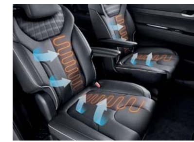
Ventilated & heated 1st & 2nd seats