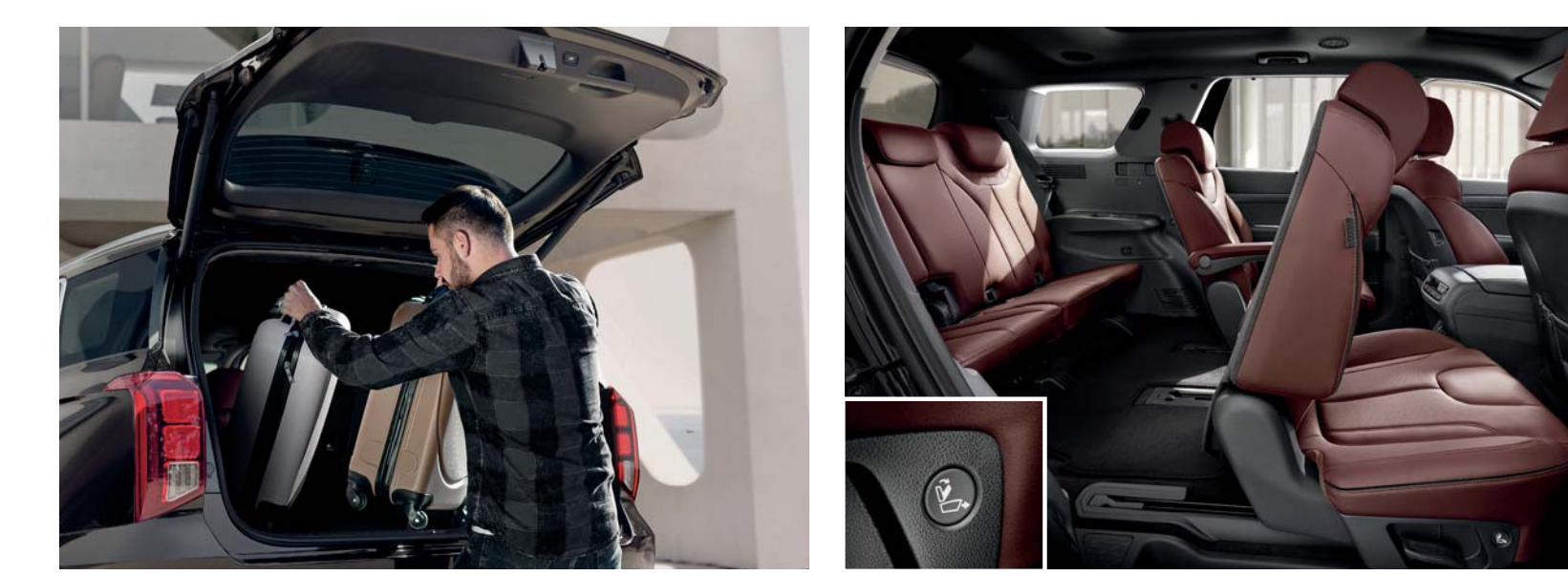
Smart tailgate system

3rd-row folded and3rd-row folded and2nd-row folded 60%2nd-row folded 40%