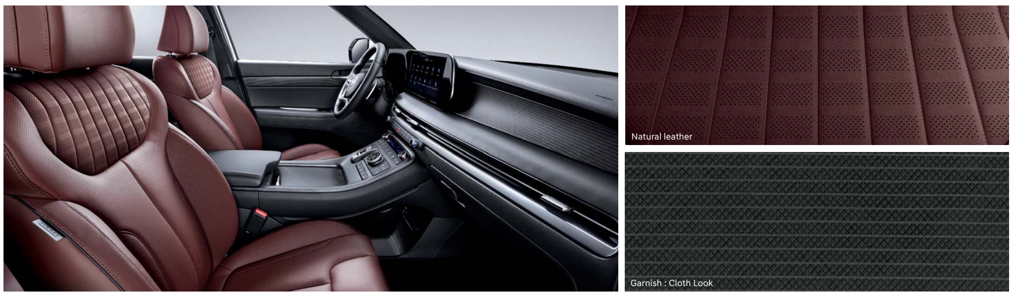
Burgundy Color Package Interior