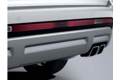
Rear fog lamps