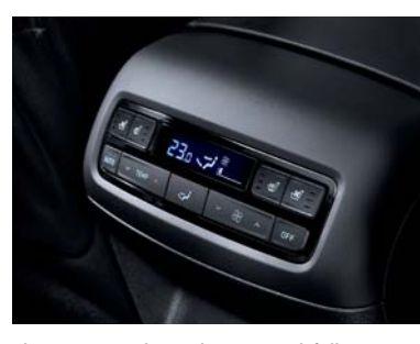
Three-zone, Independent-control, fully automatic air conditioning