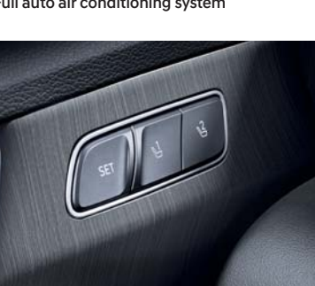
Integrated Memory System