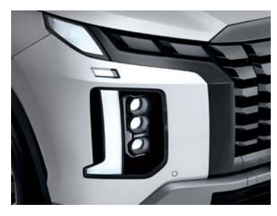
Full LED headlamps