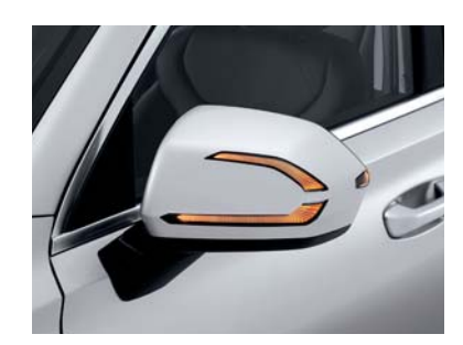
LED outside mirror repeaters