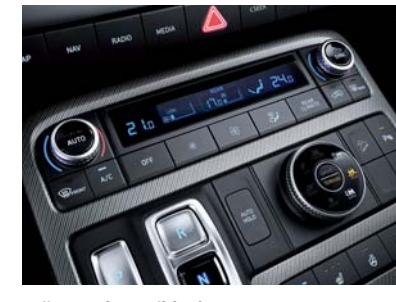
Full auto air conditioning system