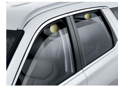
Speed variable safety power windows