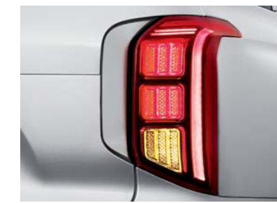
Full LED rear combination lamps