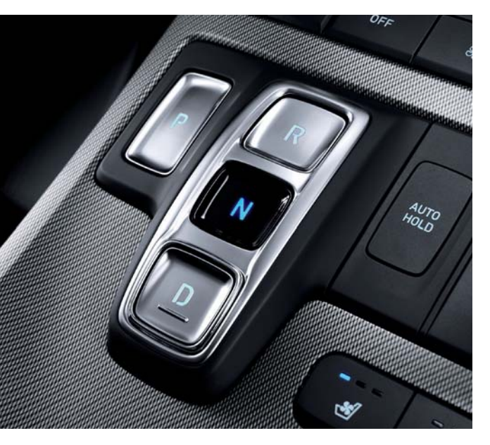
8-speed shift-by-wire automatic transmission

HTRAC All-Wheel Drive & Multi Terrain Control