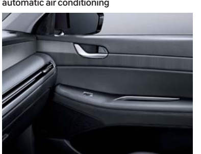
Leatherette door armrest