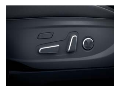
8-way power driver's seat with 2-way lumbar support