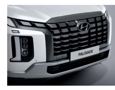
Dark chrome radiator grille