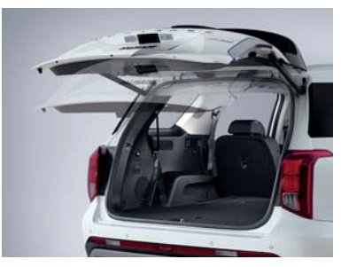
Smart tailgate system