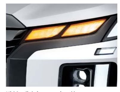
Hidden lighting turn signal lamp