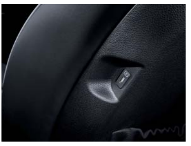
USB charging ports