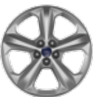
18" SPARKLE SILVER-PAINTED ALUMINUM Standard