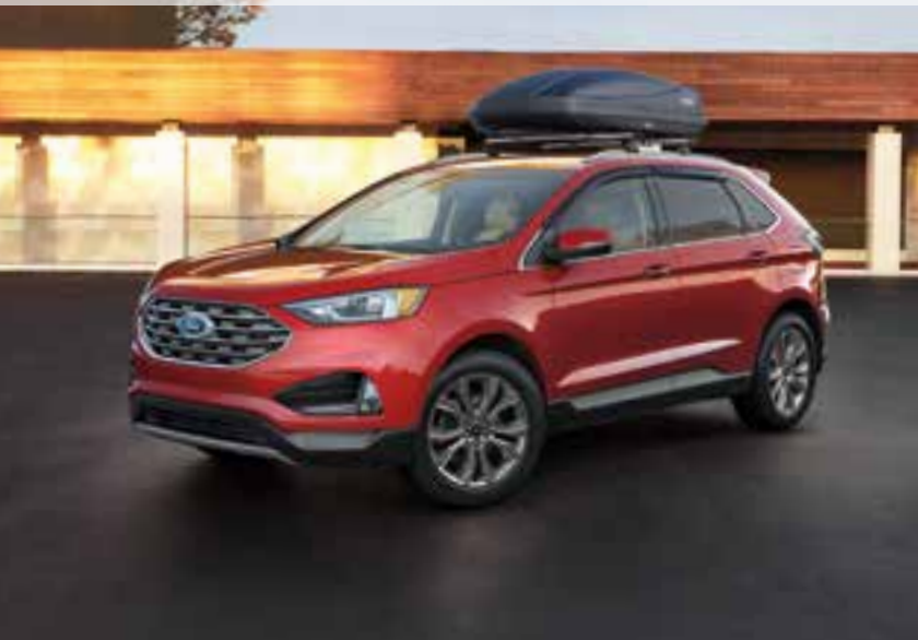
Titanium in Rapid Red Metallic Tinted Clearcoat accessorized with smoked side window deflectors, 1 front and rear molded splash guards, roof-mounted crossbars and cargo box, 1,2 and wheel lock kit