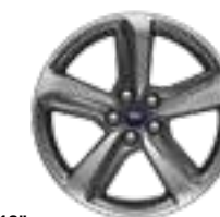
18" BRIGHT-MACHINED ALUMINUM WITH PREMIUM DARK STAINLESS-PAINTED POCKETS 3 Optional; includes snow chain-compatible tires