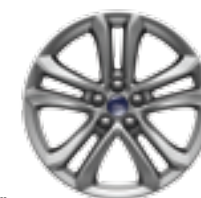
18" SPLIT-SPOKE SPARKLE SILVER-PAINTED ALUMINUM Standard