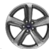
18" BRIGHT-MACHINED ALUMINUM WITH PREMIUM DARK STAINLESS-PAINTED POCKETS Optional