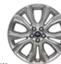
19" LUSTER NICKEL-PAINTED ALUMINUM Standard