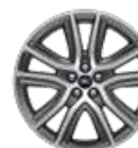
20" BRIGHT-MACHINED ALUMINUM WITH PREMIUM DARK STAINLESS-PAINTED POCKETS Optional on 300A

LEATHER-TRIMMED SEATING SURFACES: Medium Soft Ceramic, Ebony