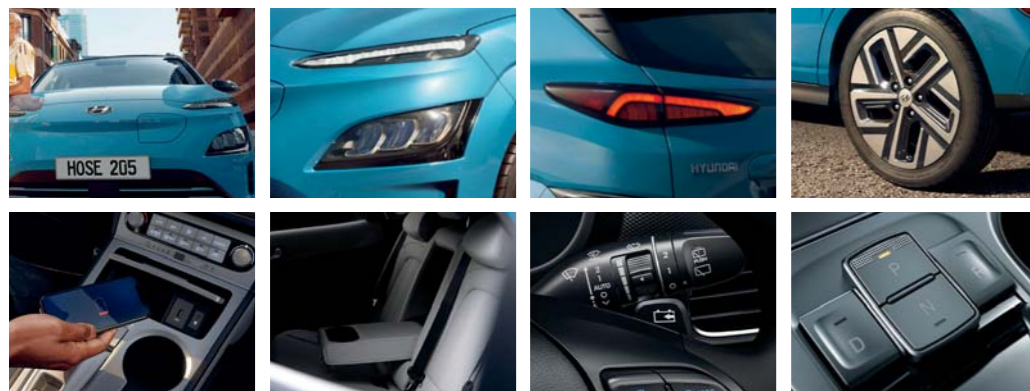
Flowing aerodynamic design Wireless charging pad Twin headlight design Heated rear seats LED rear combination lamps Paddle shifter (Regenerative braking control) 17" alloy wheel Electronic gear shift button